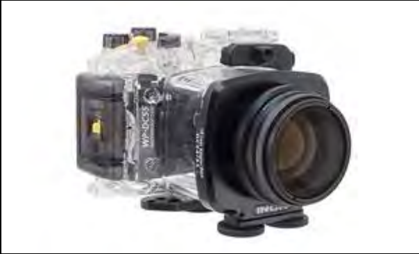
「UCL-90 LD」 on Canon 「PowerShot G7 X Mark II」/「WP-DC55」 via INON 「LD Lens Adapter Base DC54/55」