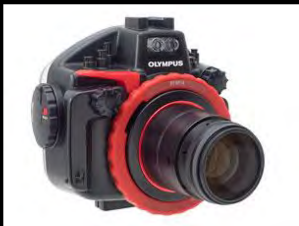
『UCL-90 M67』 on Olympus 『E-M1 Mark II』 / 『PT-EP14』 via lens port 『PP0-EP03』