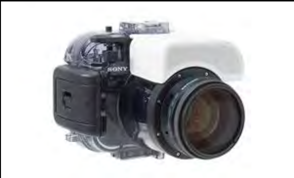
「UCL-90 M67」 on SONY「DSC-RX100M5」/「MPK-URX100A」