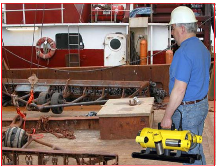
Fishers ROVs are in commercial use Worldwide

At 43 lbs, the ROV is highly portable and very "user friendly". With the optional spare parts kit, the ROV is completely field maintainable. JW Fishers SeaLion-2 ROV system represents a major breakthrough in cost/performance for a commercial grade ROV. This high performance system competes with systems more than twice the price. The SeaLion-2 is covered by a TWO YEAR WARRANTY.