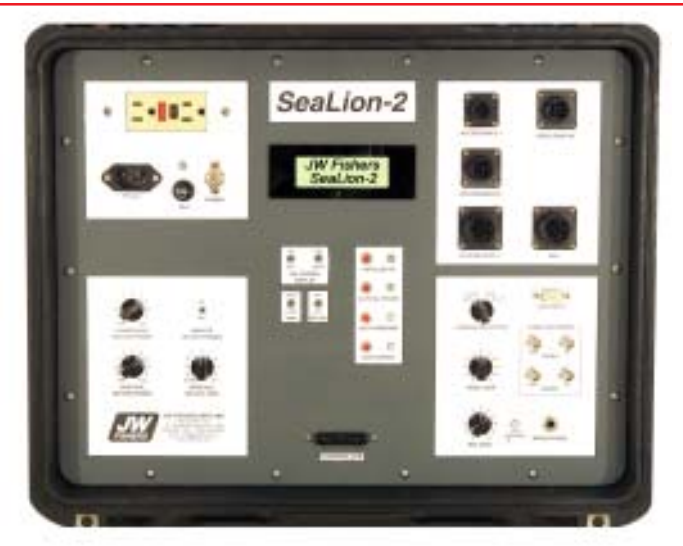
Control Panel's switches, controls, and interface connectors

The Control Panel also contains a LCD readout which displays the overall status of the system.