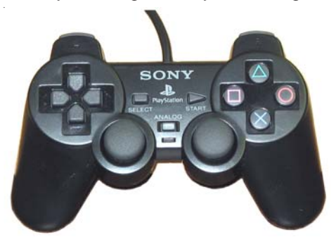
A PS2 Controller's joysticks and buttons control the ROV

When a high water current situation arises where extra power is needed, a button on the controller increases the maximun power available by 30%; significantly increasing thrust.