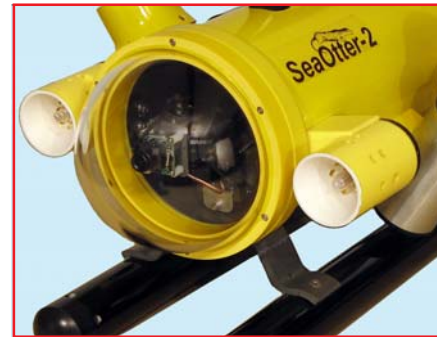
Pan and Tilt Cameras (front and back) with 100 watts of Lighting

Illumination is provided by two, 50 watt operator controlled tungsten halogen lamps for the front camera and "ultra-bright" LED cluster for the rear camera.