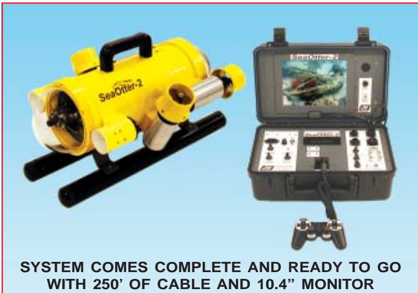
SYSTEM COMES COMPLETE AND READY TO GO WITH 250' OF CABLE AND 10.4" MONITOR