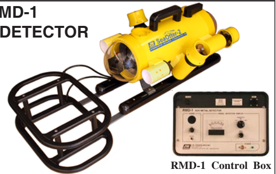
RMD-1 Control Box

The RMD-1 attaches to any ROV and makes it a roving metal detector. Find buried pipes, cables, anchors, etc., quickly and easily with the RMD-1.