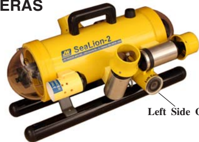
Left Side Camera

Two color side cameras, with LED lighting, can be attached to the SeaLion-2. Operator can individually view each of the four cameras. Side Cameras can be manually adjusted to view straight out or angled upward/downward.