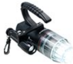
DB JR+DB LED-3